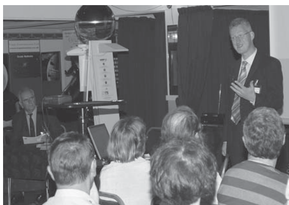
Lembit Öpik MP addresses the audience at the opening of the 6th European Dark Skies Symposium.