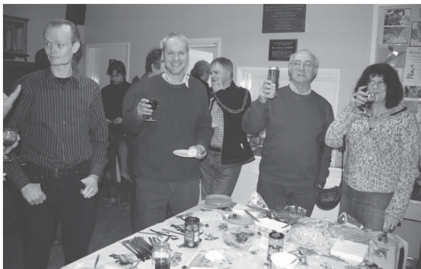
Lunch at the DSS meeting was enjoyed by all.